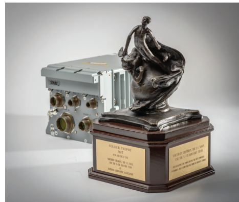
2013 Collier Trophy Industry Team Recipient X-47B Industry Team